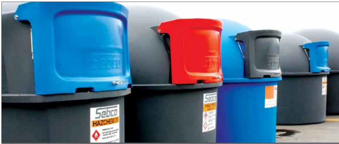
Sebco storage systems are colour-coded for diesel, AdBlue and waste oil.

"Our products have a huge range of options under each product line, ie different pumps, level indicators, fuel management systems and power sources," says Ed. "We are always looking at meeting our customers' needs, so custom made tanks are a common